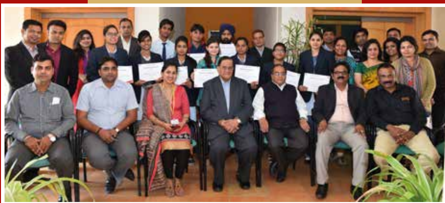
Acropolians awarded Mahindra Finance Scholarship

Mahindra & Mahindra Financial Services Ltd. has launched two scholarships for the students from under privileged communities and studying in third year of an undergraduate degree course. The program is administered by K.C. Mahindra Trust and amount per scholarship is Rs 10,000/- .